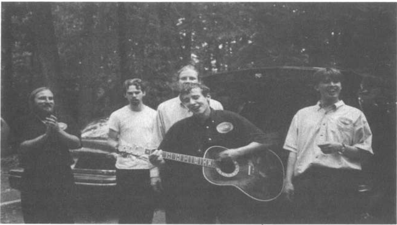
At the Memphis, TN, Family Conference: The men sang, danced and spoke about the Academy. Their trip had begun in Chicago two weeks earlier. One last singing request came just when they were piling in the car to go. Next stop: Nashville, TN, Indianapolis, IN, and all points north.