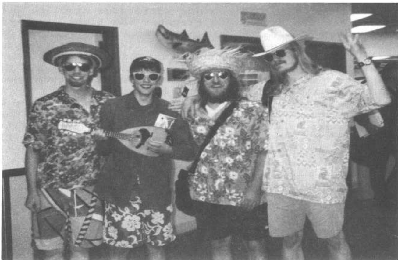
Kodiak, AK: A quick change on the plane into some clothes bought at an Anchorage thrift store makes for an unusual homecoming. Hawaiian shirts, yellow, blue and pink sunglasses, and colorful hats brighten the Kodiak Airport.

Many people have asked us what it would cost for them to subscribe to the Eagle. The Eagle has always been sent free of charge, and we would like that to continue. It is our main outreach, and one in which we try to give a flavor of our life here at the Academy. Please help us by your donation or your pledge on the enclosed form. Thank you!