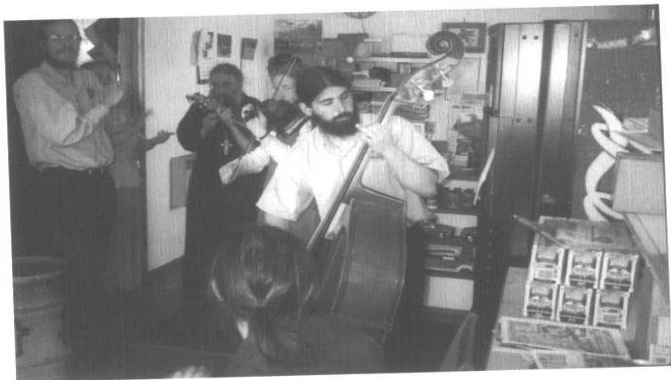
An impromptu Irish music concert in an upstate New York gas station for its Irish-born attendant.