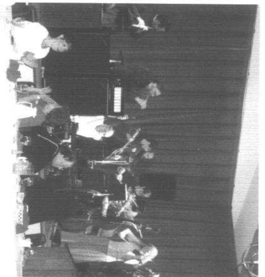
Above: Academy musicians play onstage behind the head table at the Saturday night banquet, Akron diocesan convention.