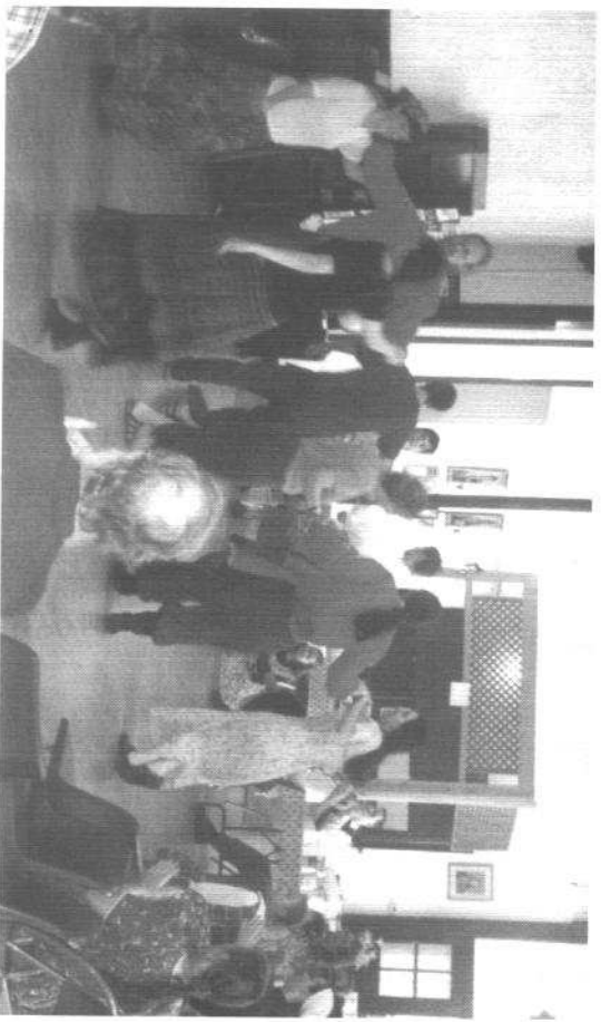
Below: In Indianapolis, parishioners joined our men for a lively "Troika."