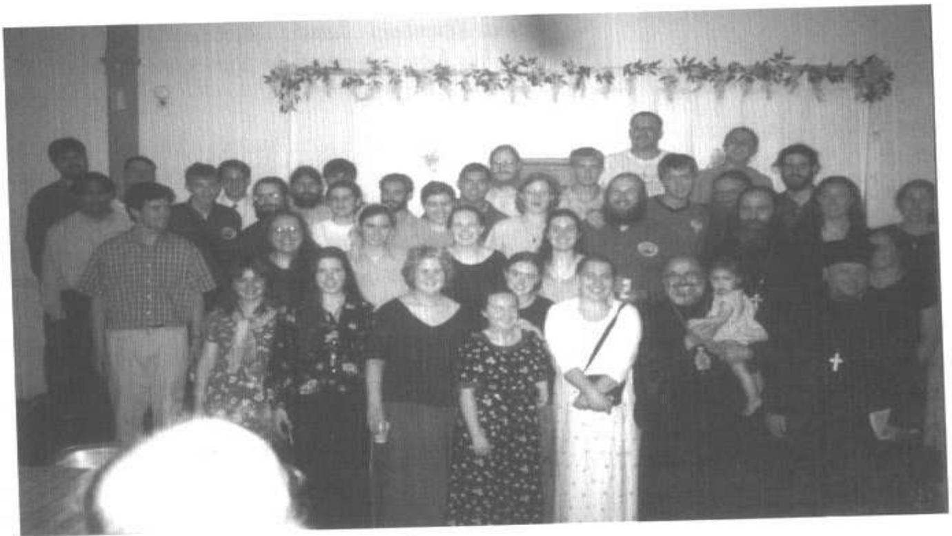
Boston: 'New Adults' Youth Conference