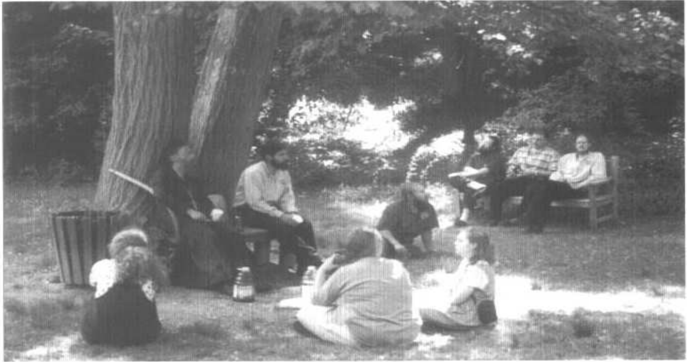
Above: A quiet moment outside Louisa May Alcott's historic Concord, Massachusetts home.