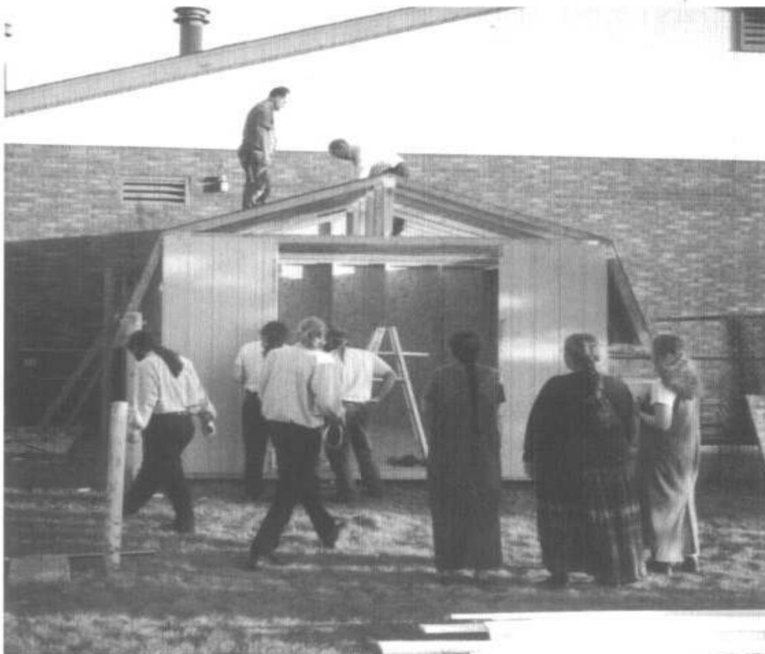
Building a 12 X 18' storage shed at St. Thomas Eastern Orthodox Church in Akron.